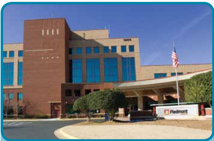
Piedmont Fayette Hospital on Highway 54 in Fayetteville

patient satisfaction among metro Atlanta hospitals according to the Hospital Consumer Assessment of Healthcare Providers and Systems survey results for the past two years.