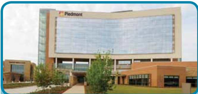
New Piedmont Newnan Hospital campus on Poplar Road