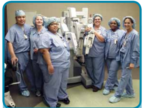
The robotics team at Piedmont-Newnan Hospital

and for six consecutive years as one of the nation's Most Wired hospitals, Piedmont Fayette is a 172-bed, acute-care community hospital offering 24-hour emergency services, medical and surgical services, as well as obstetrics, cardiac catheterization and rehabilitation services. The hospital has received top ratings in