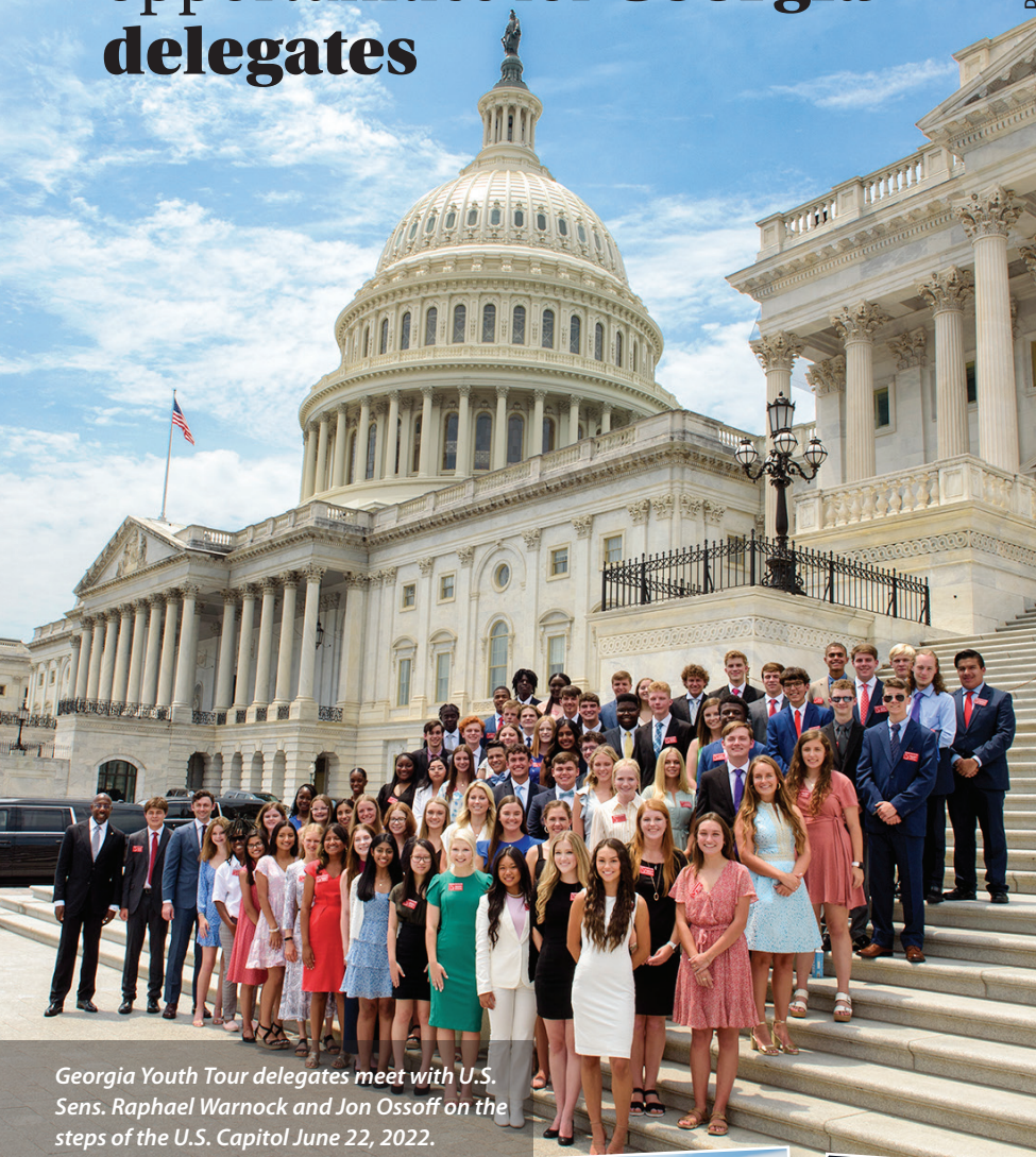
Georgia Youth Tour delegates meet with U.S. Sens. Raphael Warnock and Jon Ossoff on the steps of the U.S. Capitol June 22, 2022.

During the meetings, delegates asked members of Congress a variety of questions related to topics like energy, environmental considerations and renewables, rural broadband and their relationships with other legislators from opposite political parties. A few delegates also asked how U.S. representatives and senators are able to balance living in Washington, D.C., with representing constituents living in rural communities in Georgia.