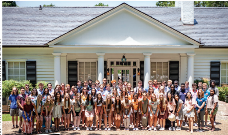
Georgia's 2022 Youth Tour delegation tours Roosevelt's Little White House in Warm Springs June 17, 2022.

The group viewed an introductory video upon arrival, then enjoyed a self-guided tour of the museum, house and grounds.