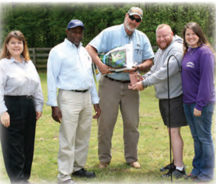
Angel's House in Newnan

On April 22, we participated in the global, grass-roots celebration by providing energy efficiency literature, green snacks and bottled water in the lobbies of