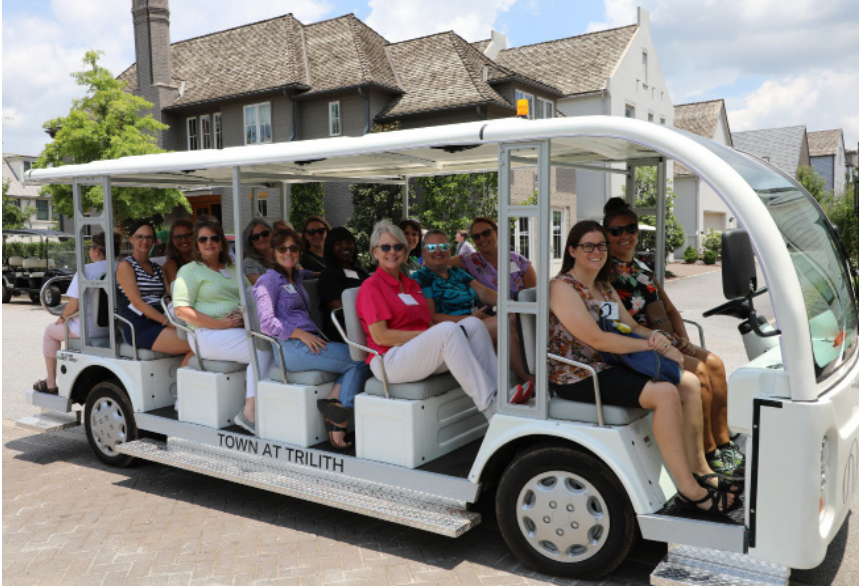
Pictured above: Coweta, Fayette and Heard County Teachers learn about energy efficiency and sustainability during a tour at the Town at Trilith. Pictured below: Teachers from Coweta, Fayette and Heard County Schools visit BMWV Auto Sales (EV dealership) to learn all about electric vehicles.