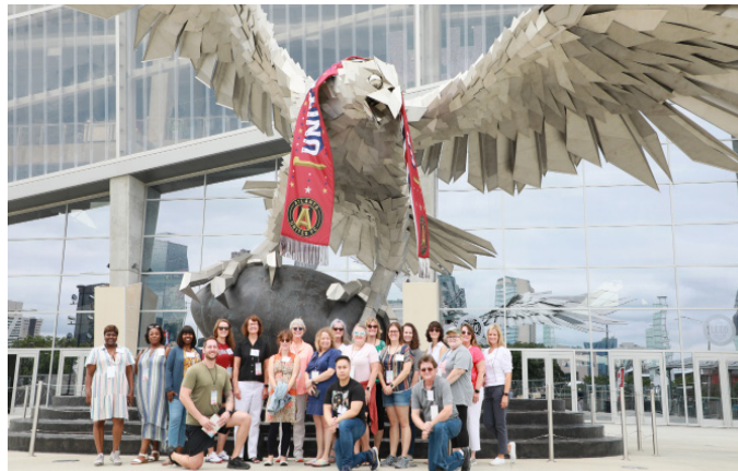
Coweta, Fayette and Heard County School System Teachers visited the Mercedes Benz Stadium as part of the Alternative Energy Summer Adventure.