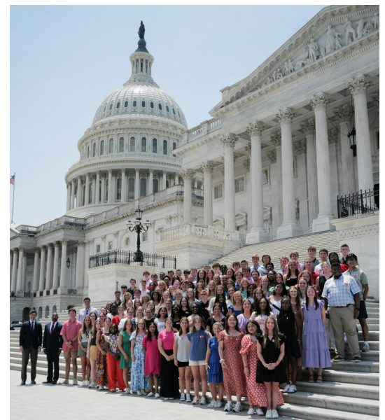
Pictured above: 2024 Georgia EMC Washington Youth Tour Delegates with Senators Jon Ossoff and Raphael Warnock.

More information about the Washington Youth Tour can be found on our website at www.utility.org . Applications for the 2025 Georgia Electric Cooperative Youth Tour (WYT) will be available in January 2025.