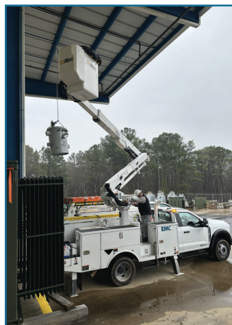
Our crews were prepared by staging materials and loading trucks with necessary equipment to quickly restore power in case of a damaging ice event.