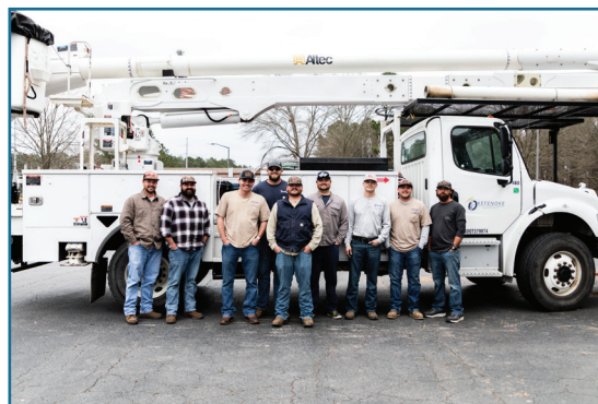
CFEMC sent 12 linemen to assist Habersham EMC in North Georgia, who sustained crippling damage to their system.

Stay warm, stay safe, and as always—CFEMC is here for you.