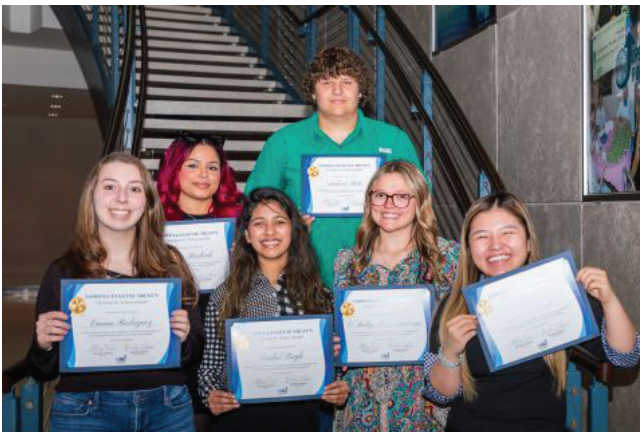
Technical/Trade School Recipients:

A total of 22 students received scholarships, including seven $1,000 technical scholarships for students attending West Georgia Technical College and Clayton State University and 15 $3,000 Melissa Segars scholarships. Recipients represented the region, with 13 students from Coweta County, eight from Fayette County and one from Heard County. Read more about Operation Round Up on the next page!